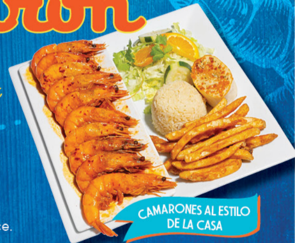
CAMARONES AL ESTILO DE LA CASA