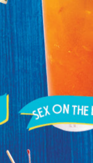
SEX ON THE BEACH