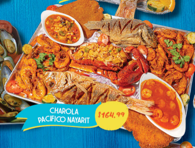
CHAROLA PACIFICO NAYARIT $164.99