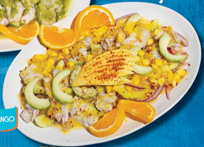
*AGUACHILES DE MANGO