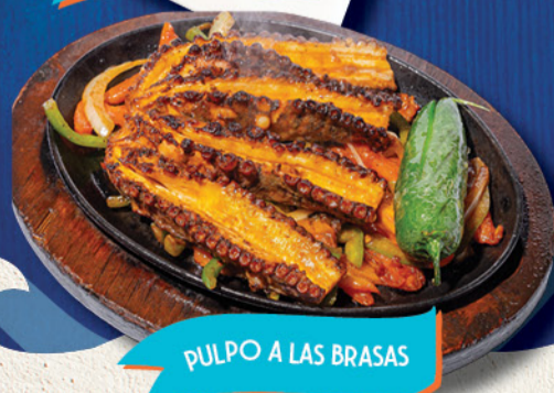
PULPO A LAS BRASAS