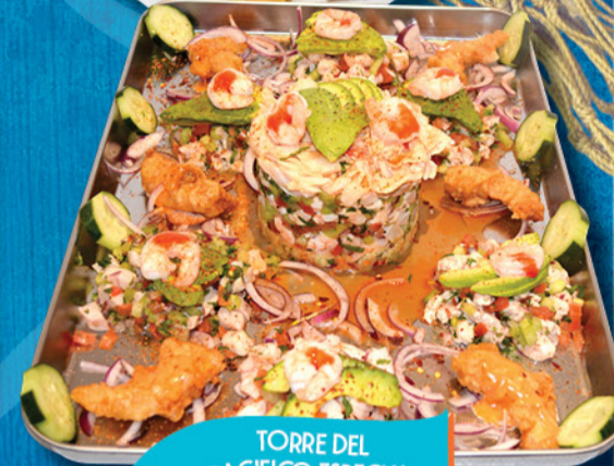
TORRE DEL PACIFICO ESPECIAL