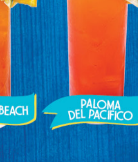
PALOMA DEL PACIFICO