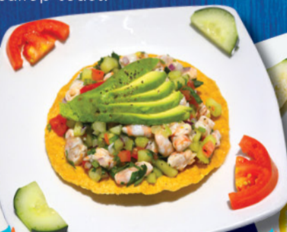
TOSTADA DE CEVICHE CAMARON