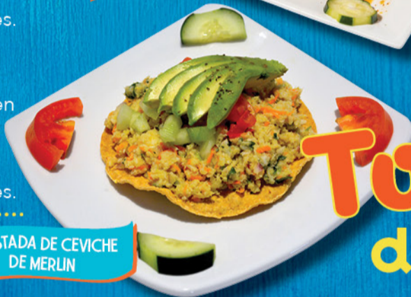
TOSTADA DE CEVICHE DE MERLIN