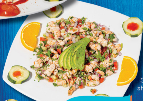
•CEVICHE DE CAMARON