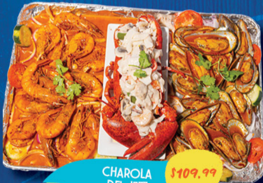
CHAROLA DEL JEFE $109.99