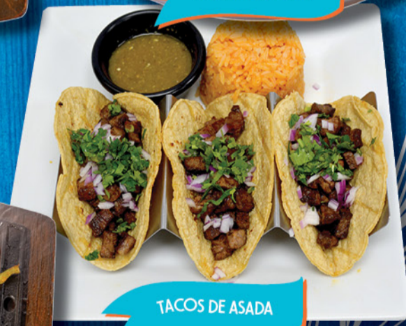
TACOS DE ASADA