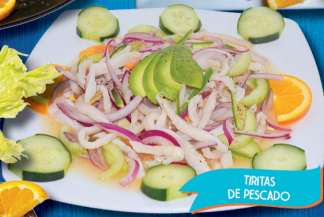
TIRITAS DE PESCADO