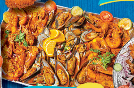
CHAROLA LOS CABOS $90.99