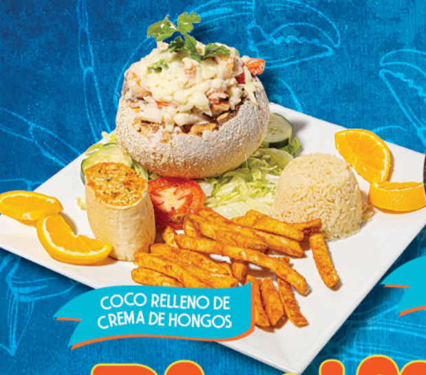
COCO RELLENO DE CREMA DE HONGOS