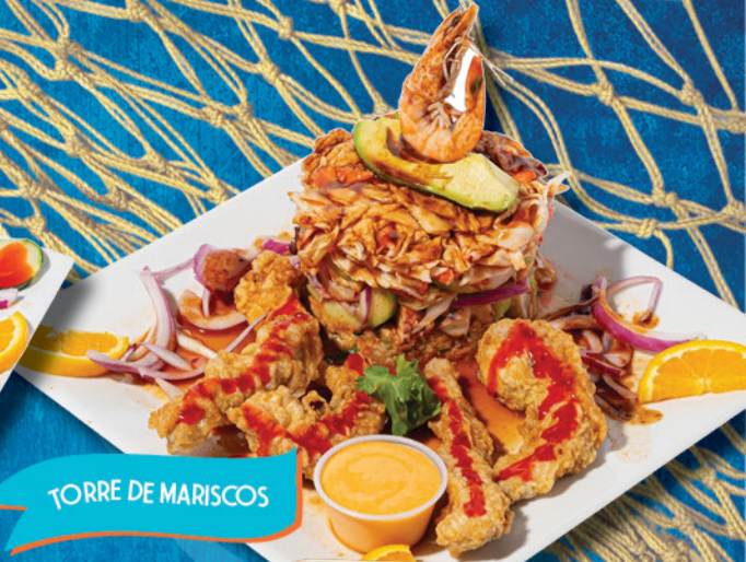
TORRE DE MARISCOS