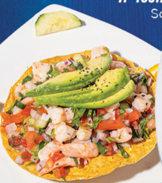
TOSTADA DE CAMARON COSIDO