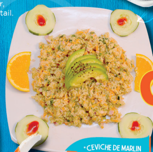
•CEVICHE DE MARLIN