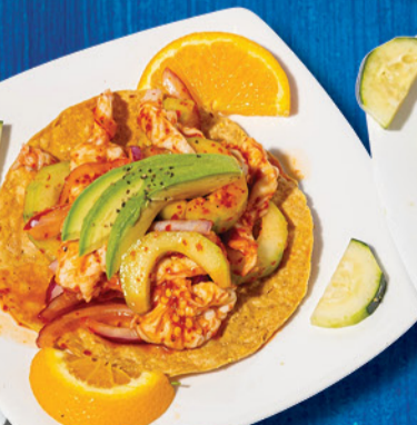
TOSTADA DE AGUACHILE ROJO