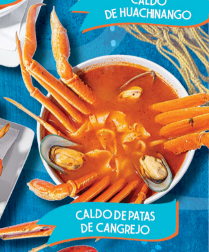
CALDO DE PATAS DE CANGREJO