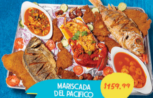
MARISCADA DEL PACIFICO $159.99