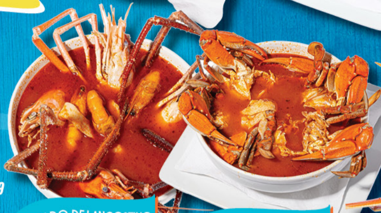
CALDO DE LANGOSTINO