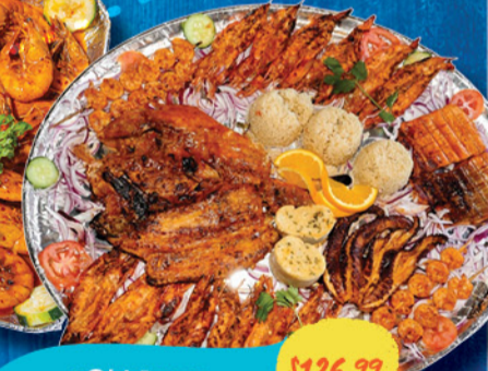
CHAROLA ZARANKEADA $126.99