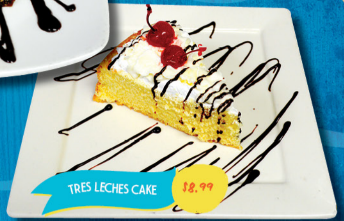
TRES LECHE CAKE $8.99