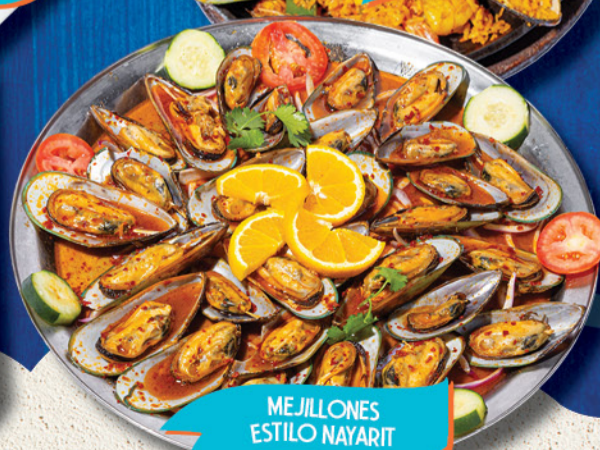
MEJILLONES ESTILO NAYARIT

*NOTICE: CONSUMING RAW OR UNDER COOKED MEATS, POULTRY, SHELLFISH OR EGGS MAY INCREASE YOUR RISK OF FOOD BORNE ILLNESS, ESPECIALLY IF YOU HAVE CERTAIN MEDICAL CONDITIONS. *PLEASE ALERT YOUR SERVER OF ANY FOOD ALLERGIES PRIOR TO ORDERING. WE ARE NOT RESPONSIBLE FOR AN INDIVIDUAL'S ALLERGIC REACTION TO OUR FOOD OR INGREDIENTS USED IN FOOD ITEMS.