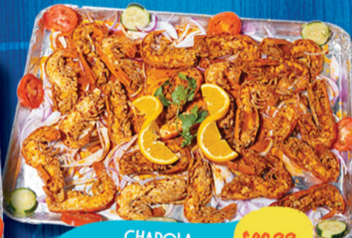
CHAROLA DE LANGOSTINOS $80.99