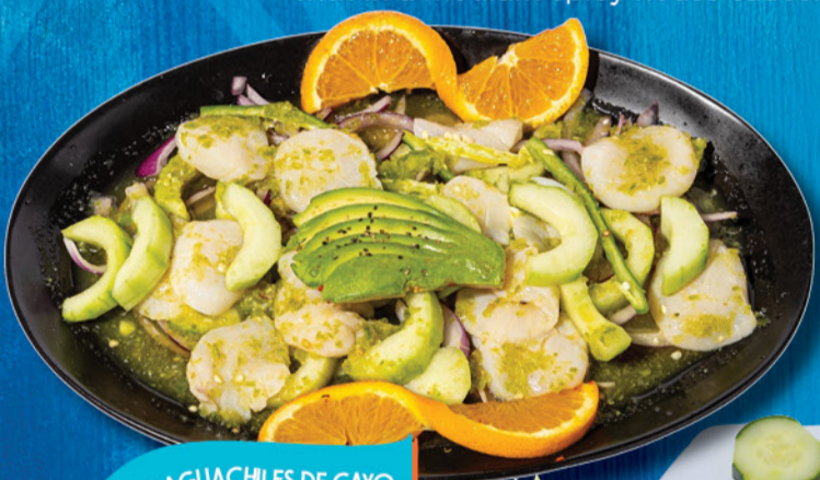
*AGUACHILES DE CAYO