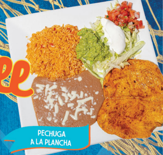
PECHUGA A LA PLANCHA

ALL FAJITAS, CARNE ASADA AND GRILLED RIBS COME WITH A SIDE OF RICE BEANS, LETTUCE, PICO DE GALLO, GUACAMOLE, SOUR CREAM AND TORTILLA.