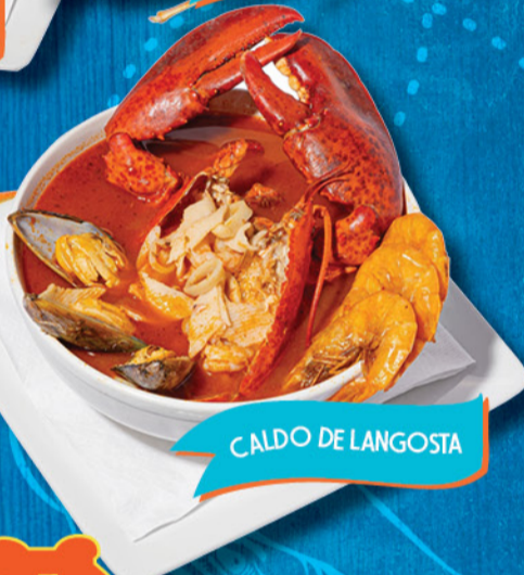
CALDO DE LANGOSTA