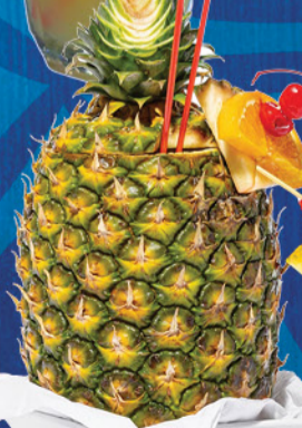
PIÑA COLADA EN SU PINA