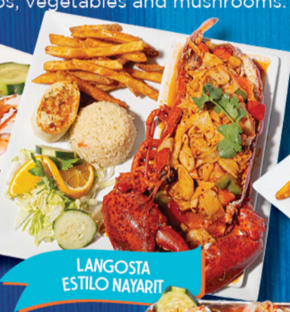
LANGOSTA ESTILO NAYARIT