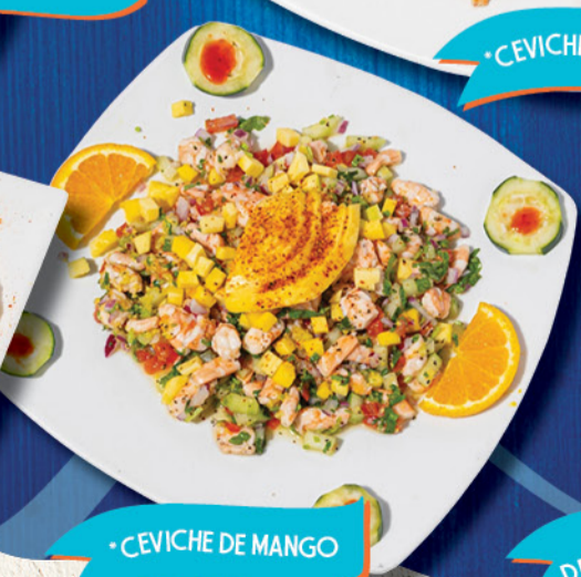
•CEVICHE DE MANGO