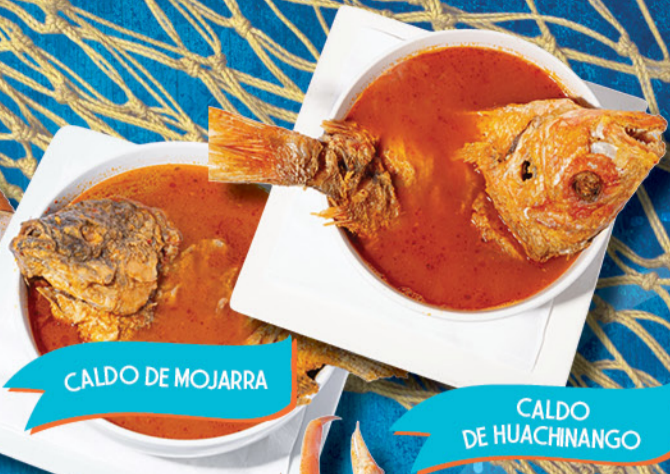
CALDO DE MOJARRA