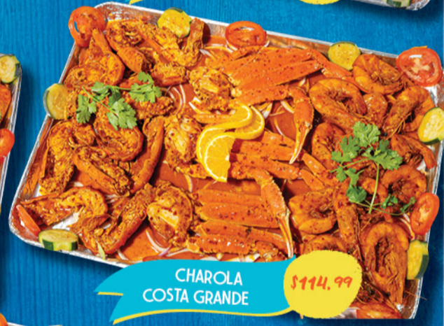
CHAROLA COSTA GRANDE $114.99