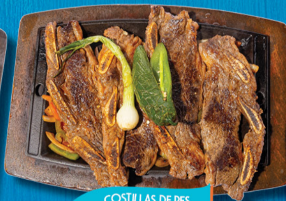
COSTILLAS DE RES AL GRILL