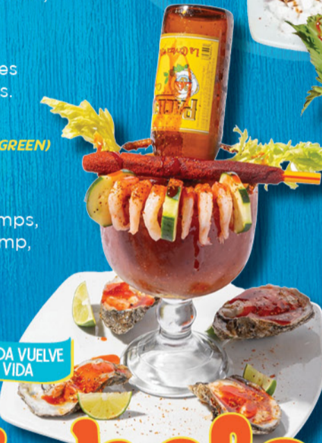
MICHELADA VUELVE A LA VIDA