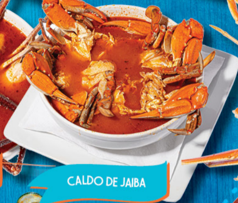
CALDO DE JAIBA