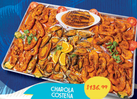
CHAROLA COSTEÑA $136.99