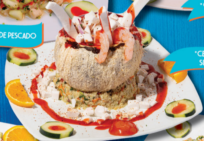
•CEVICHE EN SU COCO