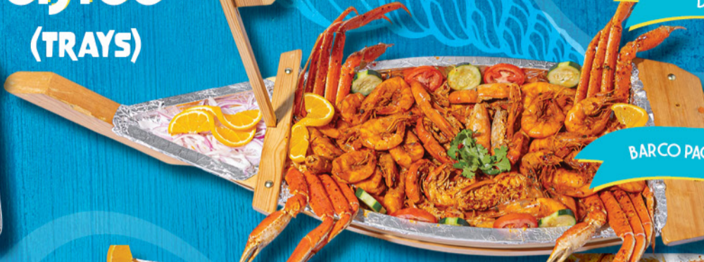
BARCO PACIFICO $199.99