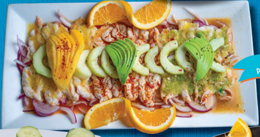
*AGUACHILES PACIFICO NAYARIT