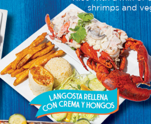
LANGOSTA RELLENA CON CREMA Y HONGOS