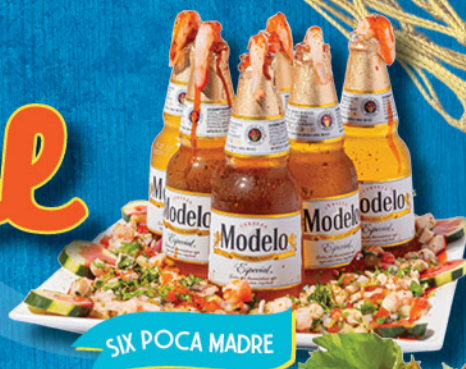
SIX POCA MADRE

6 bottle or can beer, Cooked head on shrimps, 6 raw oysters prepared with octopus, shrimp, tomato, cucumber and onion, with a side of coconut.