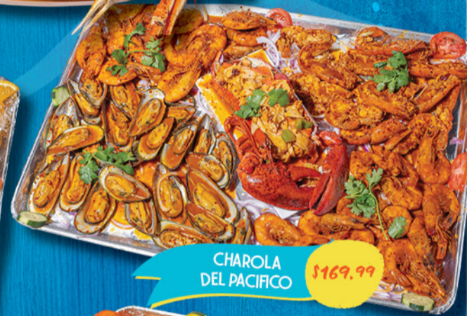
CHAROLA DEL PACIFICO $169.99