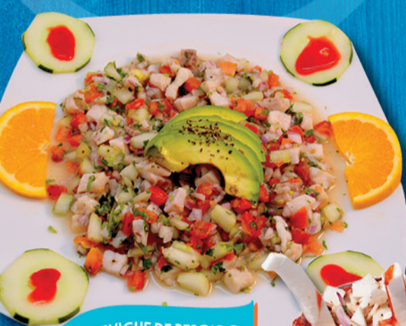
•CEVICHE DE PESCADO