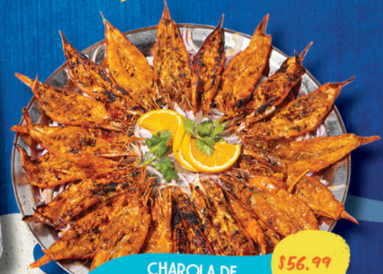
CHAROLA DE CAMARONES ZARANKEADOS $56.99

*NOTICE: CONSUMING RAW OR UNDER COOKED MEATS, POULTRY, SHELLFISH OR EGGS MAY INCREASE YOUR RISK OF FOOD BORNE ILLNESS, ESPECIALLY IF YOU HAVE CERTAIN MEDICAL CONDITIONS. *PLEASE ALERT YOUR SERVER OF ANY FOOD ALLERGIES PRIOR TO ORDERING. WE ARE NOT RESPONSIBLE FOR AN INDIVIDUAL'S ALLERGIC REACTION TO OUR FOOD OR INGREDIENTS USED IN FOOD ITEMS.