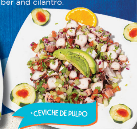
•CEVICHE DE PULPO