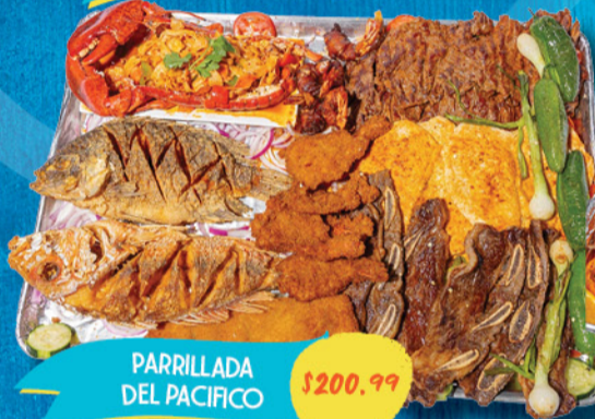
PARRILLADA DEL PACIFICO $200.99