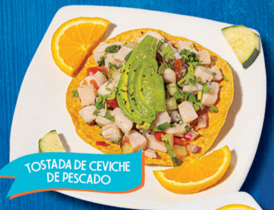
TOSTADA DE CEVICHE DE PESCADO

Shrimps marinated with a mango spicy sauce in a fried toast.