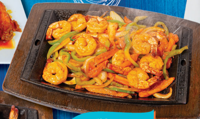
FAJITA DE CAMARON