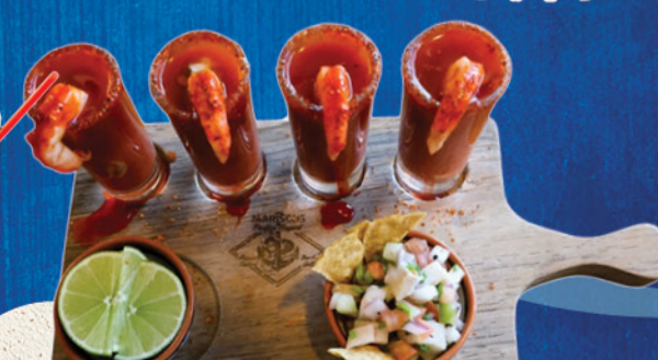
4 BALAZOS DEL PACIFICO

*NOTICE: CONSUMING RAW OR UNDER COOKED MEATS, POULTRY, SHELLFISH OR EGGS MAY INCREASE YOUR RISK OF FOOD BORNE ILLNESS, ESPECIALLY IF YOU HAVE CERTAIN MEDICAL CONDITIONS. *PLEASE ALERT YOUR SERVER OF ANY FOOD ALLERGIES PRIOR TO ORDERING. WE ARE NOT RESPONSIBLE FOR AN INDIVIDUAL'S ALLERGIC REACTION TO OUR FOOD OR INGREDIENTS USED IN FOOD ITEMS.