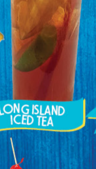
LONG ISLAND ICED TEA