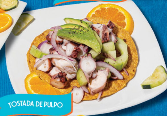
TOSTADA DE PULPO