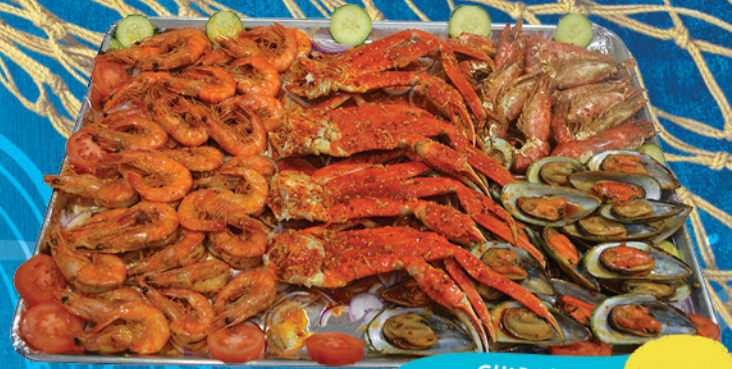
CHAROLA DEL MAR $215.99