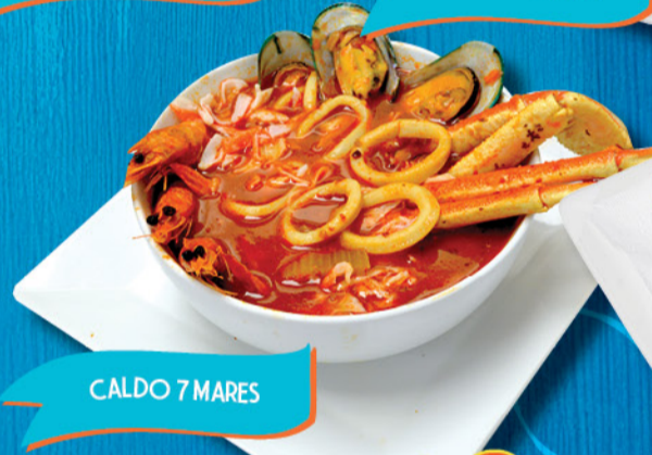
CALDO 7 MARES