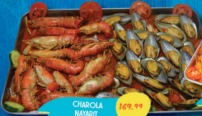
CHAROLA NAYARIT $69.99