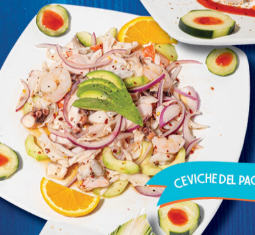
•CEVICHE DEL PACIFICO