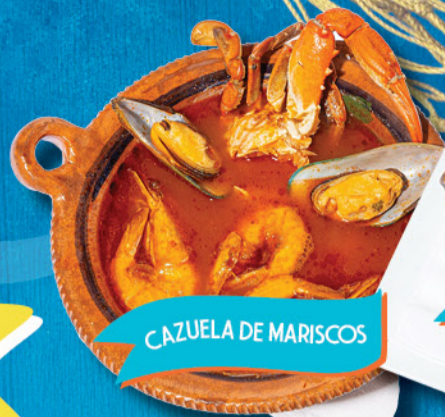
CAZUELA DE MARISCOS