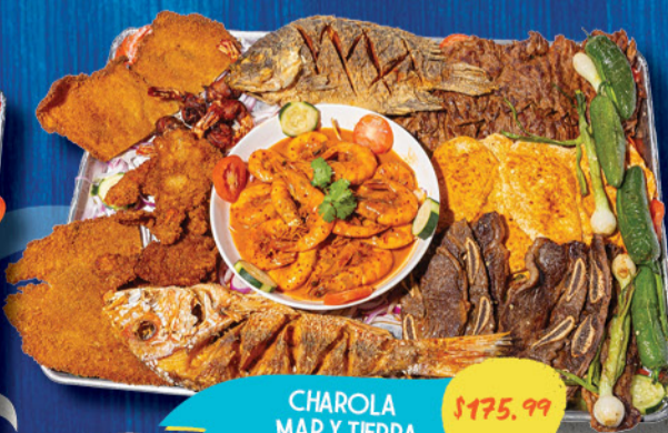
CHAROLA MAR Y TIERRA $175.99