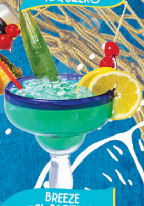
BREEZE DEL PACIFICO