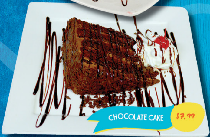
CHOCOLATE CAKE $7.99