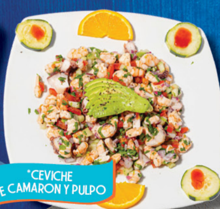
•CEVICHE DE CAMARON Y PULPO