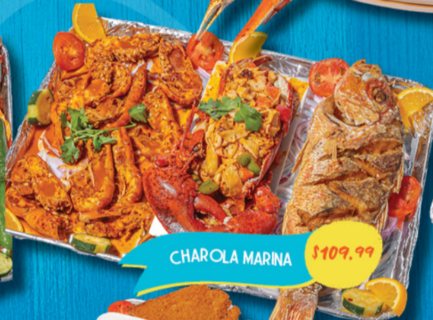
CHAROLA MARINA $109.99