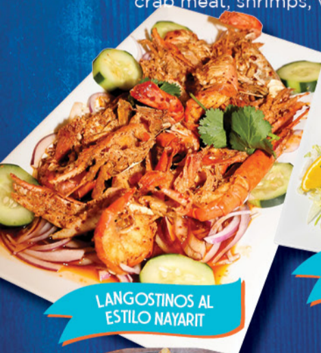
LANGOSTINOS AL ESTILO NAYARIT

Rice with a mix of octopus, calamari, mussels, shrimps and vegetables. ( SIDE OF BREAD ).