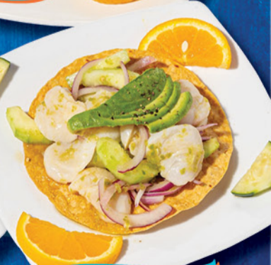
TOSTADA DE CAYO

*NOTICE: CONSUMING RAW OR UNDER COOKED MEATS, POULTRY, SHELLFISH OR EGGS MAY INCREASE YOUR RISK OF FOOD BORNE ILLNESS, ESPECIALLY IF YOU HAVE CERTAIN MEDICAL CONDITIONS. *PLEASE ALERT YOUR SERVER OF ANY FOOD ALLERGIES PRIOR TO ORDERING. WE ARE NOT RESPONSIBLE FOR AN INDIVIDUAL'S ALLERGIC REACTION TO OUR FOOD OR INGREDIENTS USED IN FOOD ITEMS.