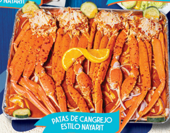
PATAS DE CANGREJO ESTILO NAYARIT